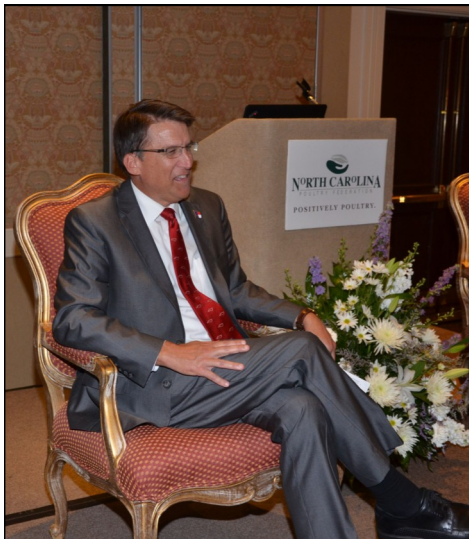
Governor Pat McCrory