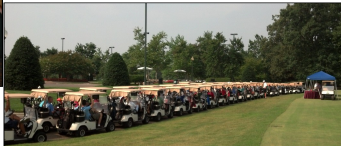
What a site! It was a glorious day the 64 golf carts lined up for the shotgun start on the challenging West Course.