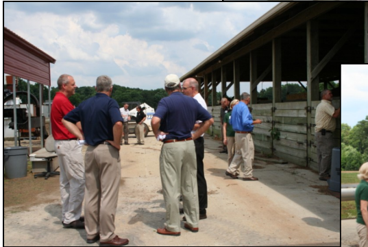
Waste Processing Facility.