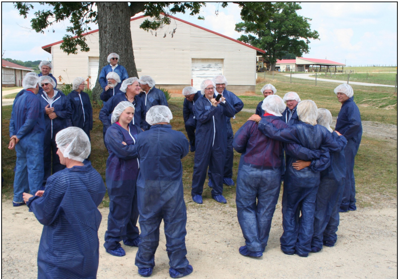
(L to R) ...What appears to be blue aliens are actually completely unidentifiable members of NCPF, NCSU faculty, NCSU staff, various visiting vets and nutritionists— all preparing for a poultry house tour.