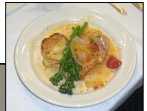
A fabulous poultry-laden plated lunch was served.